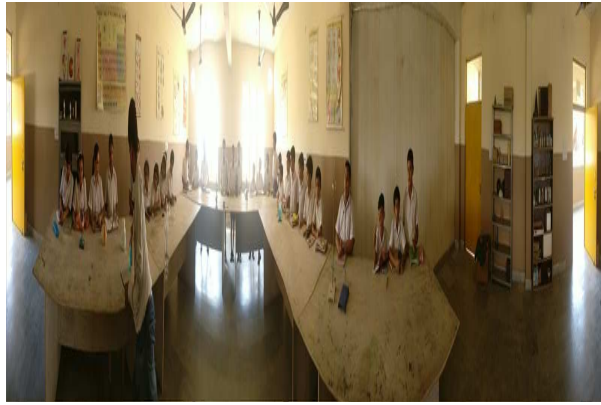
PHYSICS LAB PHOTO